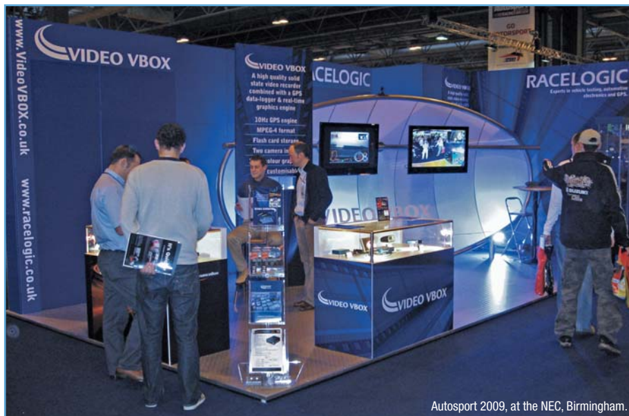
Autosport 2009, at the NEC, Birmingham.